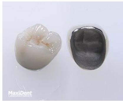
Metal fused to ceramic Crowns

Porcelain-fused-to-metal tooth coloured crowns can be used for either front or back teeth. These tooth crowns are strong enough to withstand heavy biting pressures. At the same time they can have an excellent cosmetic appearance.