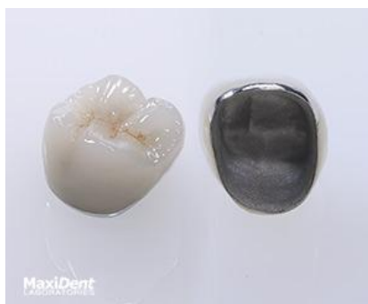
Metal fused to ceramic Crowns

Porcelain-fused-to-metal tooth coloured crowns can be used for either front or back teeth. These tooth crowns are strong enough to withstand heavy biting pressures. At the same time they can have an excellent cosmetic appearance.