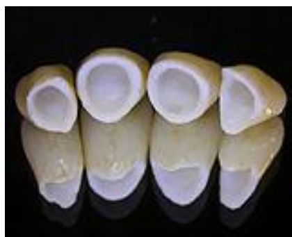
All Ceramic Crowns