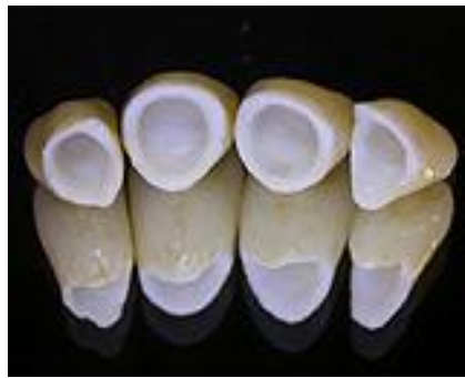
All Ceramic Crowns