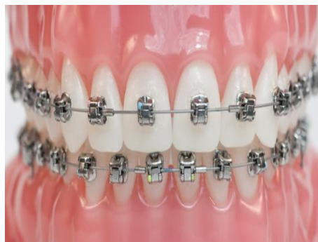
Normal Top Teeth and Normal on lower Teeth