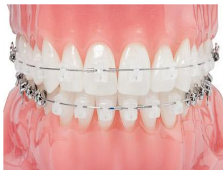
Mix of Clear and Normal