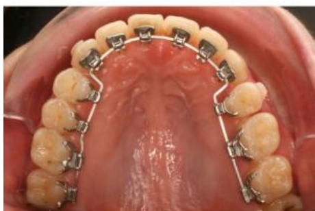
Braces on the inside (Tongue Side)