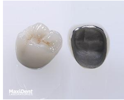
Metal fused to ceramic Crowns

Porcelain-fused-to-metal tooth coloured crowns can be used for either front or back teeth. These tooth crowns are strong enough to withstand heavy biting pressures. At the same time they can have an excellent cosmetic appearance.