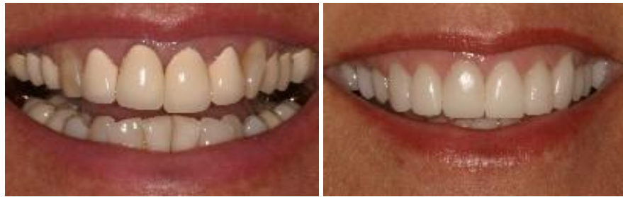
Compare the translucency of old fashioned metal crowns and the modern Metal Free Crowns

Porcelain-fused-to-metal tooth coloured crowns can be used for either front or back teeth. These tooth crowns are strong enough to withstand heavy biting pressures. At the same time they can have an excellent cosmetic appearance.